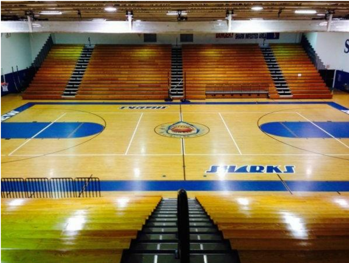
Judges View (above) / Spectator View (below)