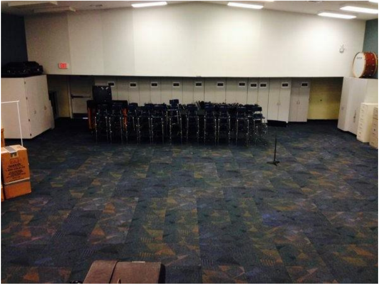
Body Warm-up (above) / Equipment Warm-up (below)